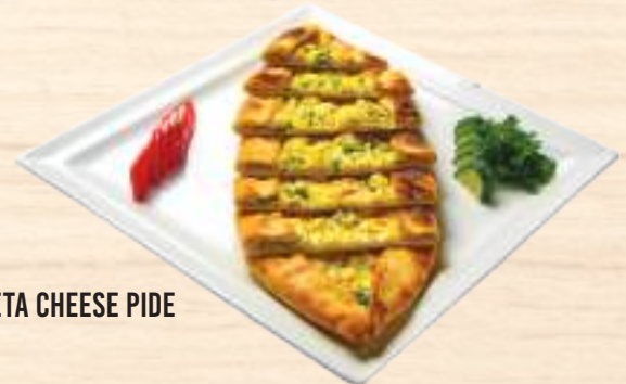
FETA CHEESE PIDE