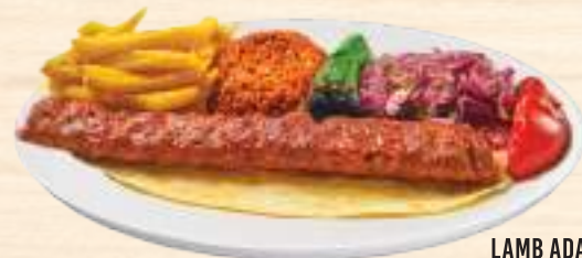
LAMB ADANA KEBAB

Expertly hand-minced lamb, seasoned with bold spices, skillfully molded onto skewers, and grilled over charcoal. Served on lavash bread with bulgur rice, fries and onion salad.