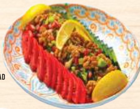
ÇOBAN (CHOBAN) SALAD

A light and refreshing salad made with finely ground bulgur, cherry tomatoes, fresh parsley, and a flavorful mix of olive oil and pomegranate sauce.