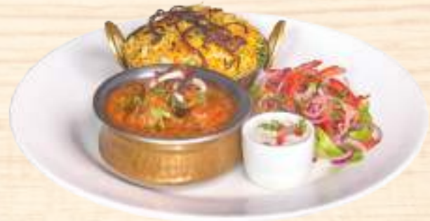
BEEF BIRYANI/CHICKEN BIRYANI

Succulent king prawns, sautéed and simmered in a rich tomato and coconut sauce served with steamed rice or Ugali.