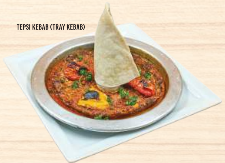
TEPSI KEBAB (TRAY KEBAB)

Assorted vegetables with juicy tomatoes, crisp onions, and colorful peppers, infused with a blend of paprika, cumin and black pepper served with Bulgur Rice & Pita Bread.