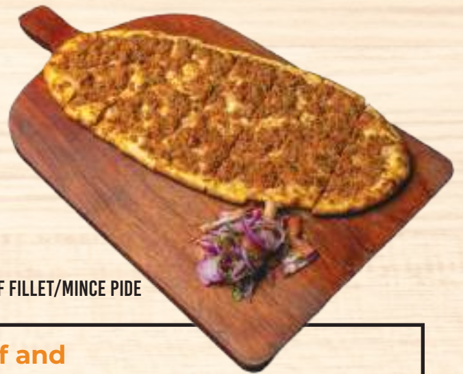
BEEF FILLET/MINCE PIDE

Savory Turkish flatbread topped with tender chicken, tomatoes, bell peppers, onions, and a fragrant blend of oregano, red paprika and black pepper brushed with melted butter.