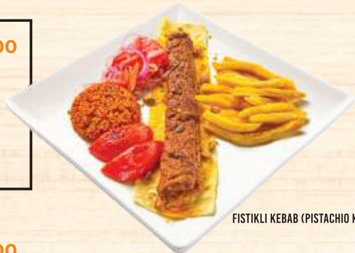
FISTIKLI KEBAB (PISTACHIO KEBAB)

A unique twist on traditional kebabs, lamb mince blended with pistachios, skewered, and grilled to smoky perfection. Served on lavash bread with bulgur rice, fries and onion salad.