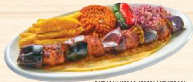
PATLICAN KEBAB (EGGPLANT KEBAB)

Fusion dish combines Indian and Turkish flavors, marinated paneer in Mediterranean spices and herbs skewered and char grilled. Served on lavash bread with bulgur rice, fries and onion salad.