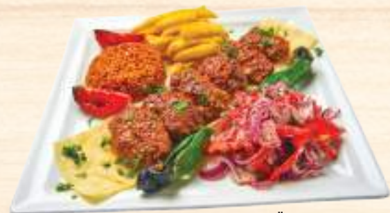
IZGARA KÖFTE (MEATBALLS)

Tender marinated beef chunks skewered and grilled to juicy perfection, Served on lavash bread with bulgur rice, fries and onion salad.