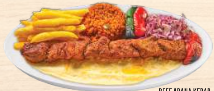
BEEF ADANA KEBAB

Spiced hand-minced beef, skillfully molded onto skewers and grilled over charcoal. Served on lavash bread with bulgur rice, fries and onion salad.