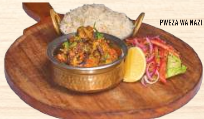
PWEZA WA NAZI