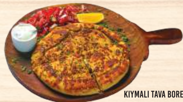
KIYMALI TAVA BOREGI