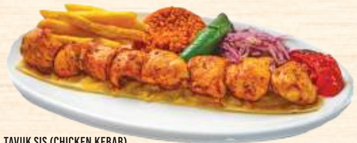
TAVUK SIS (CHICKEN KEBAB)

Marinated chunks of chicken, grilled over charcoal for a smoky aroma, Served on lavash bread with bulgur rice, fries & onion salad.