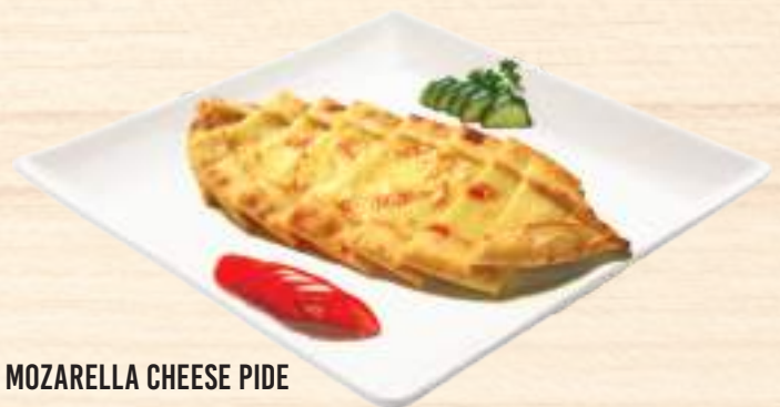
MOZARELLA CHEESE PIDE

A hearty Turkish flatbread loaded with beef fillet, fresh vegetables, herbs, & spices, complemented by a buttery finish