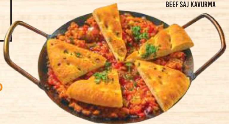
BEEF SAJ KAVURMA

Mouthwatering chunks of beef stir-fried with onions, tomatoes and bell peppers, seasoned with a fragrant blend of paprika, cumin and black pepper served with Bulgur Rice & Pita Bread.