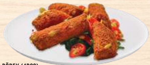
PAÇANGA BÖREK (4PCS)