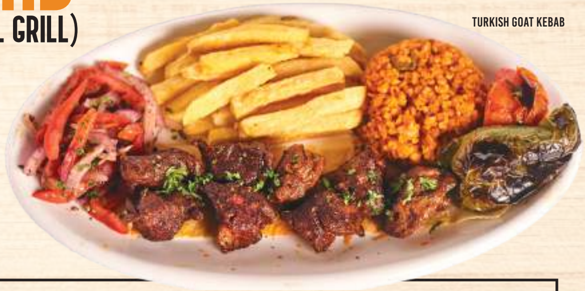
TURKISH GOAT KEBAB