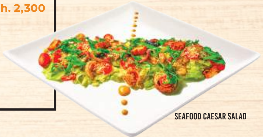
SEAFOOD CAESAR SALAD

Topped with crunchy golden croutons and a generous sprinkle of Parmesan cheese, served with warm, buttery garlic toast.