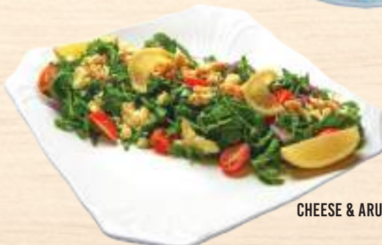
CHEESE & ARUGULA SALAD

A perfect combination of white feta cheese, peppery arugula, cherry tomatoes, and red onions, infused with sumac, olive oil, and a drizzle of pomegranate sauce.