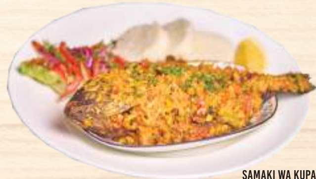
SAMAKI WA KUPAKA