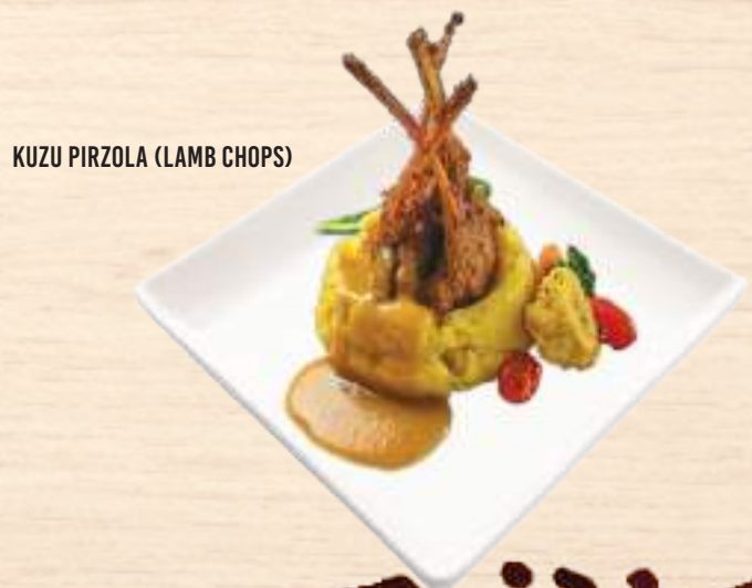
KUZU PIRZOLA (LAMB CHOPS)

for those who crave bold cuts and bigger bites... Crafted with care, served with attitude.